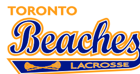
Toronto Beaches Minor Lacrosse Association