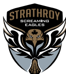
Strathroy Screaming Eagles Minor Lacrosse Association