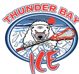
Thunder Bay Ice Minor Lacrosse Association