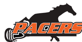
Sarnia Pacers Minor Lacrosse Association