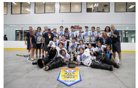
OSHAWA BLUE KNIGHTS U17 "A" Division