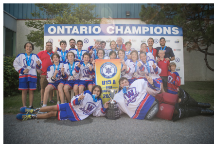
WHITBY WARRIORS U15 "A" Division