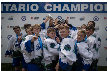
PETERBOROUGH LAKERS U13 "A" Division